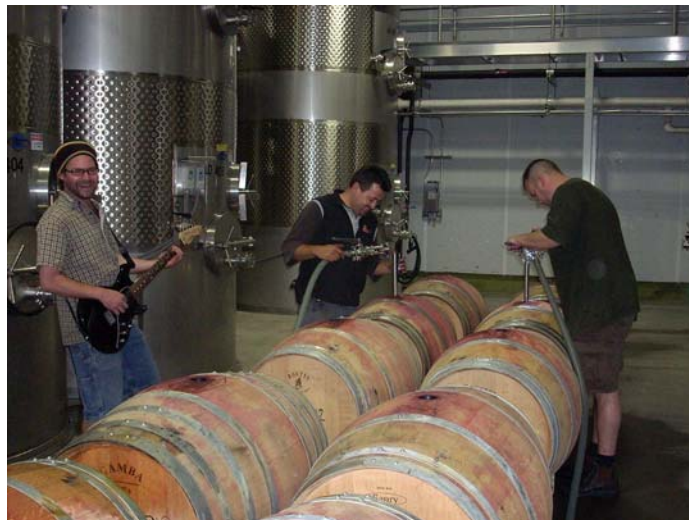
Just another day at Bin to Bottle.

BTB's investments in new technology and a new 25,000 sq. ft. barrel facility are definitely signs of success. In the pursuit of JOY, we at BTB are enthusiastic about all the new additions at the winery including the Rockin' new sound system.